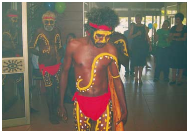
■ Indigenous smoking ceremony at the opening of the new Darwin Family Relationship Centre premises.

Other highlights included RANT's delivery of mediation training to members of an Aboriginal community in Arnhem Land and the development of the Indigenous model of mediation by the Indigenous advisors in Central Australia.