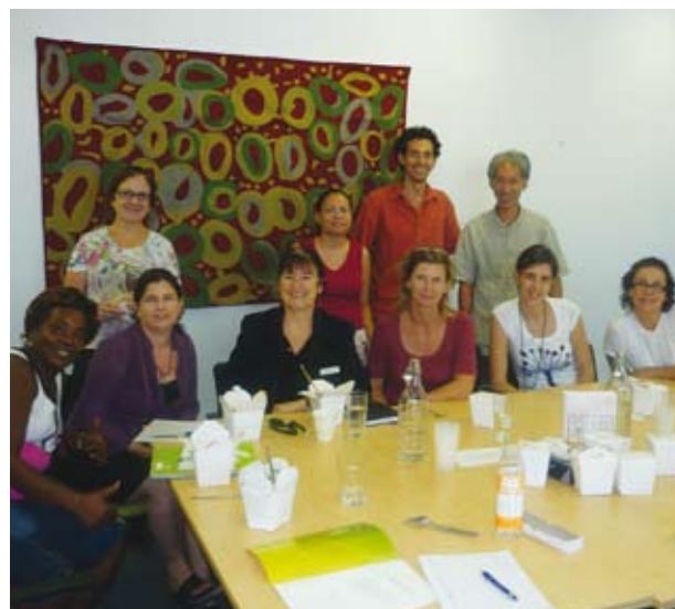
■ RANT CALD project interagency meeting with Melaleuca Refugee Centre held 28 May 2009.

Recognising the impact that economic pressures can have, many employers have been keen to support their staff experiencing organisational restructuring, retrenchment, workplace and personal relationship challenges. Consequently, demand for our Employee Assistance Programs has grown, with RAWA experiencing a 30% increase in the use of its EAP services since December 2008.