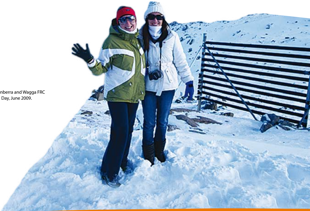
■ Canberra and Wagga FRC Team Day, June 2009.